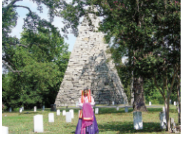
...marrying the Confederate Monument in Virginia.