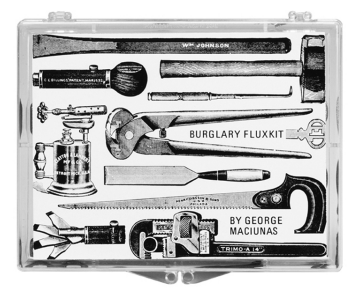
George Maciunas (A'52, Dec.), Burglary Fluxkit (1971) (Hood Museum of Art, Dartmouth College, George Maciunas Memorial Collection: Gift of the Friedman Family)

VanDerBeek's (A'56, Dec.) pioneering media art was exhibited in The